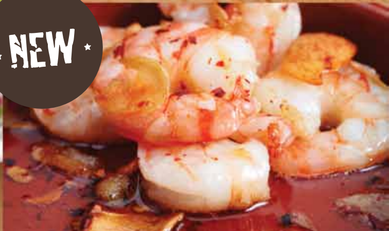
Bildene kan avvike noe i forhold til hvordan rettene serveres. The pictures may be slightly different than how the dishes are served.